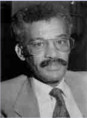
አቶ ናይዝጊ ክፍሉ

አብ'ዚ ቅንያትዚ፡ አብ መራኸቢ ብዙሓን ሃገርና፡ አብ መዛናግዒ ማእከላት ከምኡውን ብቴሌፎን፡ ቀንዲ መዛረቢ ጉዳይ ከይኮነ ዘሎ፡ አቶ ናይዚ ክፍሉ ምዕራፉ ዘይኮነ፡ አብ ኤርትራ ሓመድ ንኸድብ፡ ብመንግስቲ ህግደፍ ስለዝተኸልከለ እዩ። እቲ ጉዳይ፡ ዘሕዝን ዘሕንኸን ካብ ም'ዃኑ ሓሊፉ፡ መሰረታዊ ሰብአዊ መሰል ዝግህስ ብሙ'ዃኑ፡ ኩሉ ኤርትራዊ ክኹን፡ ዝግባእ ተግባር እዩ።